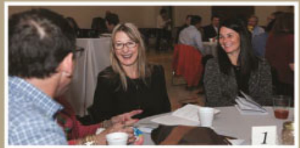
Conversation about the message

SEVEN THURSDAY NIGHTS February 8th - March 21st, 2024 6:00-8:30 pm St. Cletus Parish Hall