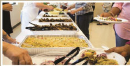
A great (free) dinner