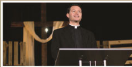
An engaging video message