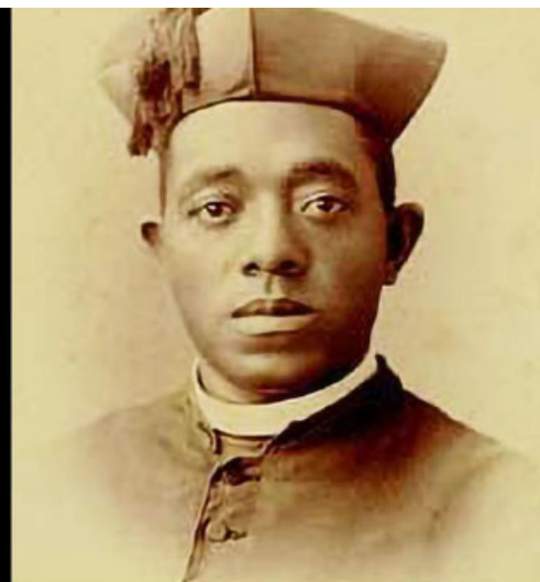
Fr. Augustus Tolton

He was a beloved preacher, but resented by many other priests.