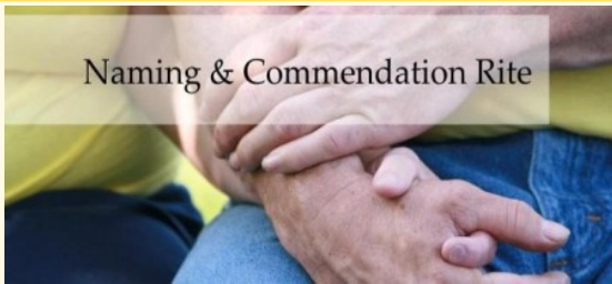
Naming & Commendation Rite

"Where two or three are gathered, there I am..."